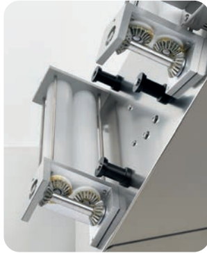
Metal gears transmission

Certified to UL 763 and NSF 08 Certified to CSA Standard C22.2