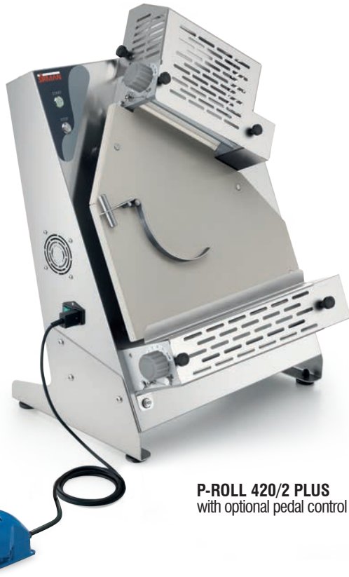
P-ROLL 420/2 PLUS with optional pedal control