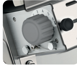
Adjustable thickness by plastic knobs