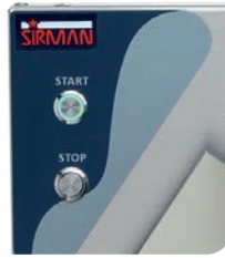
IP 67 stainless steel controls